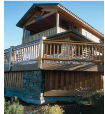
Enclose under decks so firebrands do not fly under and collect.