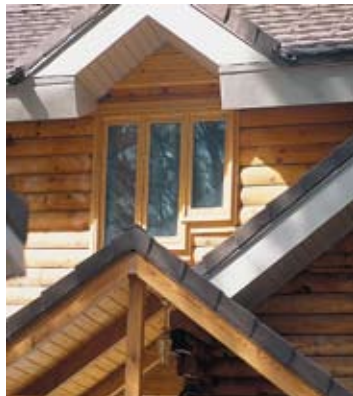
Enclose eaves and soffits.