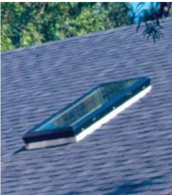
Use glass skylights; plastic will melt and allow embers into the home.